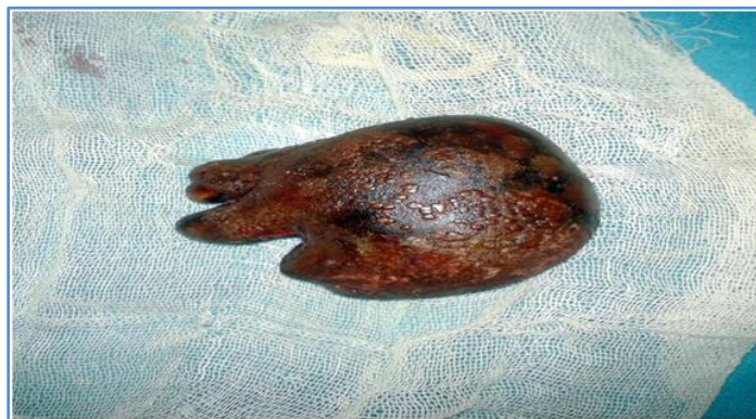
Fig. 2: Giant renal calculus (8 cm) extracted from an extrarenal pelvis